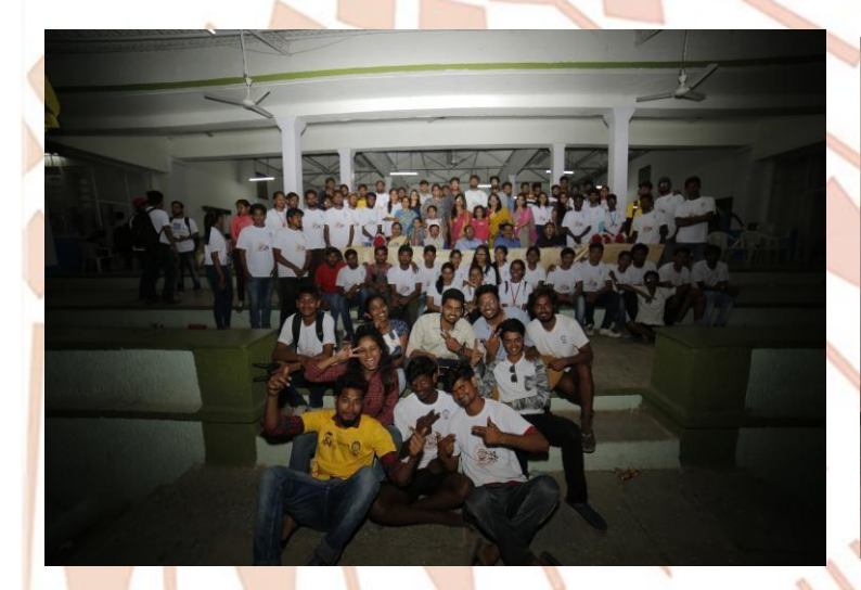
Kurukshetra Event 2018