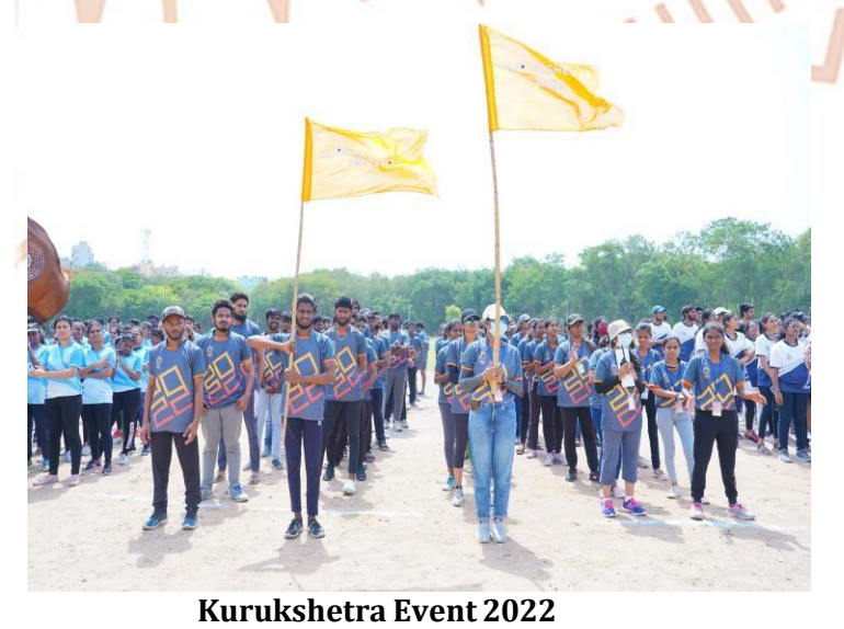
1. DIWALI EVENT 2019