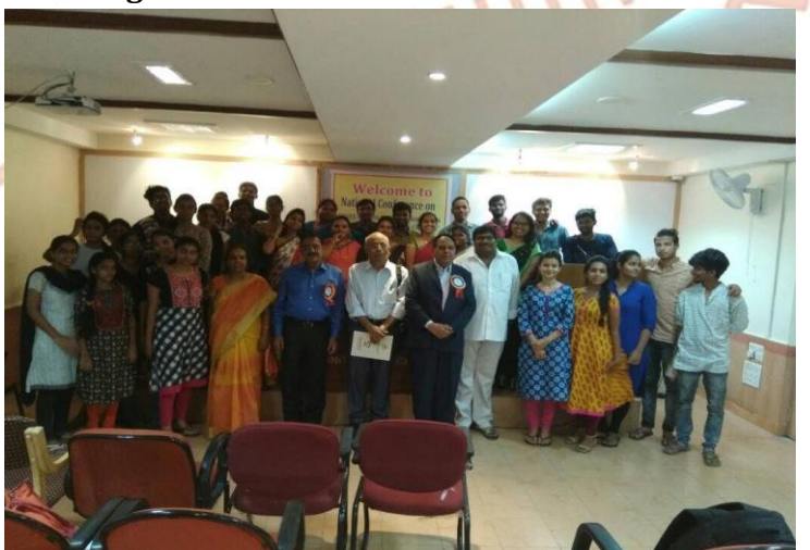
1. Dynamics of Hindu Temple Architecture:

1. National Conference on Suitability Development Progamme