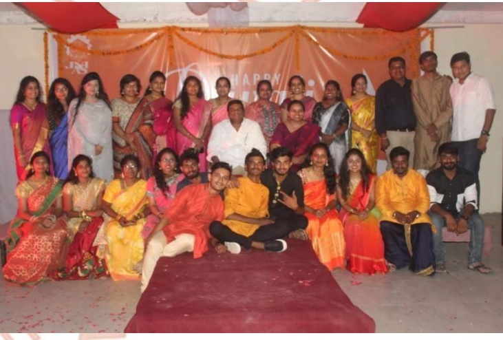
3. Farewell /Freshers Party 2012 to 2020