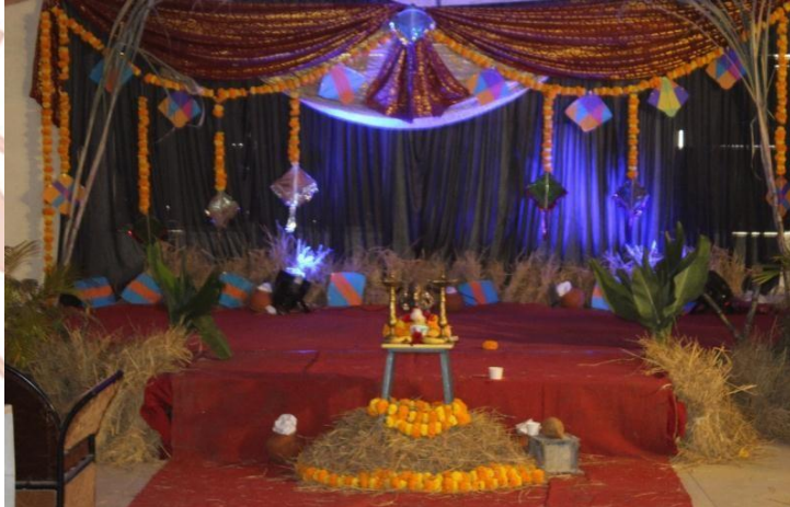
Traditional Days Celebrations: