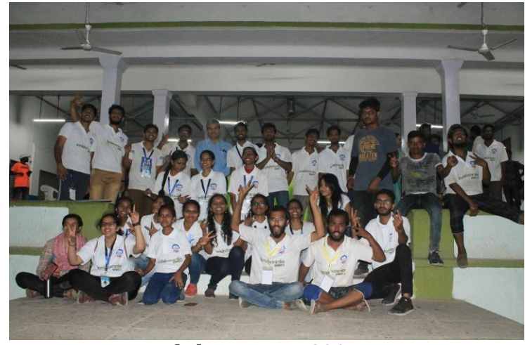
Kurukshetra Event 2017